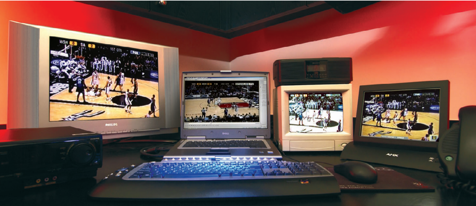
Home Court Advantage Editing stations allow coaches to create customized video for practices and meetings.

This outstanding system is part presentation system, part video conferencing system, part editing suite and pure genius.