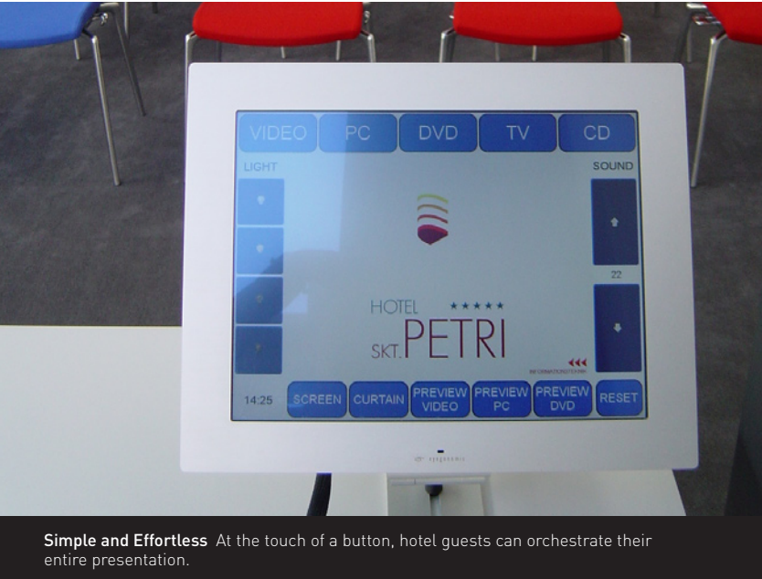
Simple and Effortless At the touch of a button, hotel guests can orchestrate their entire presentation.

© 2007 AMX. All rights reserved. AMX, Modero, Max by AMX, NetLinX and the AMX logo are all registered trademarks of AMX. AMX reserves the right to alter specifications without notice at any time.