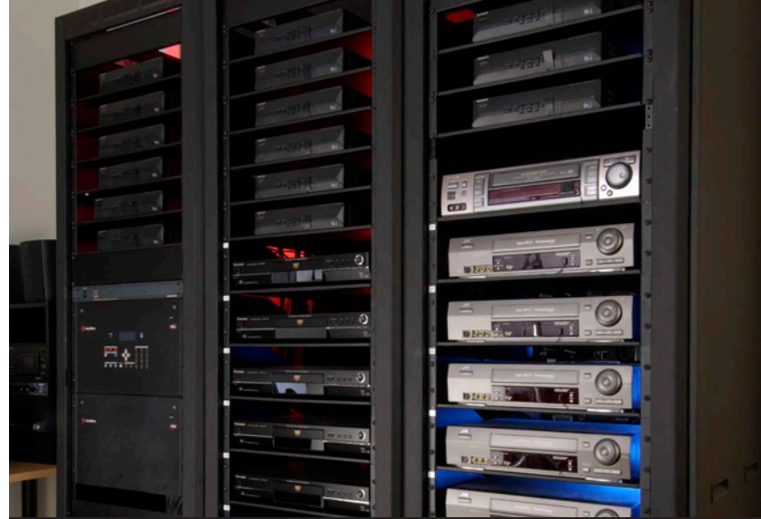
Instant Replay Satellite receivers automatically send televised games to DVD and VHS recorders for recall at the touch of a button.

The facility's AMX NetLinx Control System controls video distribution and connects to the Local Area Network (LAN), while also allowing IR control of the AMX AutoPatch Matrix Switcher through any of the source devices. The flexibility and large scale configuration of the AMX AutoPatch Switcher connects the main video room, player training