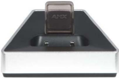
FIG. 2 MXA-HST CHARGING CRADLE (FRONT)

NOTE: Fully charging the handset may require up to eight hours.